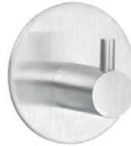
Round or Square