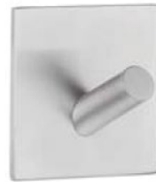
Round or Square